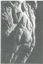
Venus of Laussel

Neanderthals vanished 30,000 years ago. Strongest of them could lift maybe half a ton. Some early myths talk of stupid giants used to build monuments. Not accepting earlier forms of religious experience does not make them stupid. Another unwarranted example of how mythologies deemed them stupid is that they engaged their prey in direct combat, animal to animal, eye to eye; not stupid, but very brave. We successors, hurl projectiles with increasingly more destructive potential, killing from a distance, farther and farther away, all the way to Star Wars. Modern killing has no connection, is 'remote'.